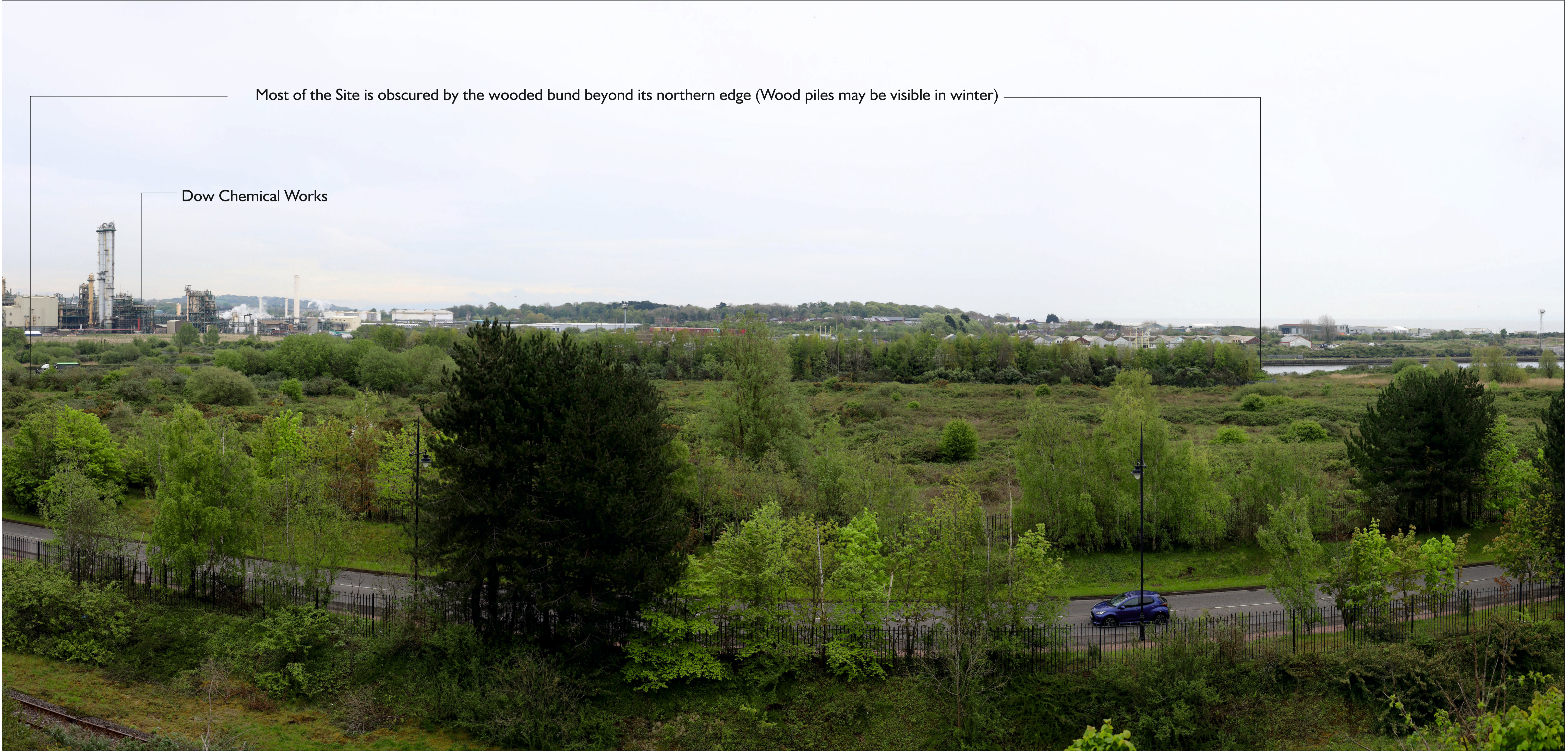
Representative Viewpoint 14 - Looking southeast from Dock View Rd at junction with Wilfred St (Distance to Site - 190m to 320m)